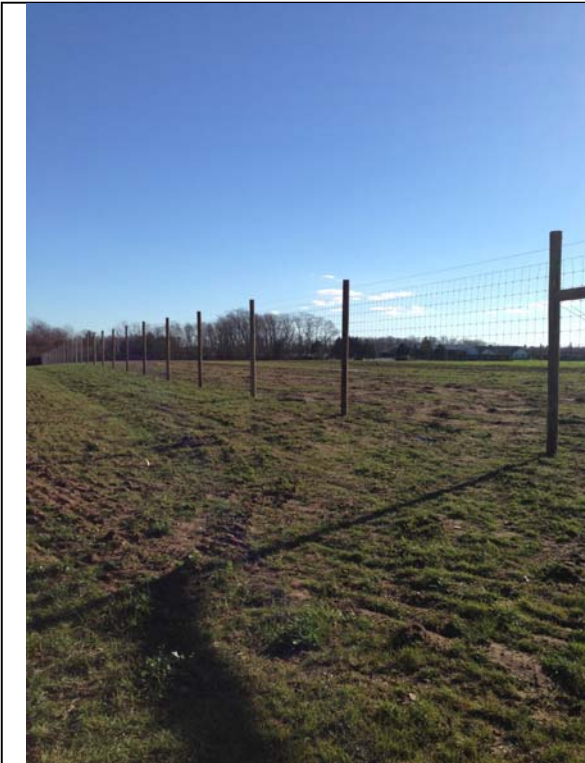
Best Management Practice—Deer Control Fence Standard 382A Woven Wire

The Suffolk County Soil and Water Conservation District received $600,000 from FY 2015 – 2017 for the installation of deer fence to farmers who are experiencing crop damage from the over population of white-tail deer. Cost sharing was provided to sixty (60) farmers for the installation of Deer Fence on agricultural land. All participants were required to follow USDA NRCS Standards and Specifications. These funds were approved in the NYS Budget for the past three (3) years and have been tentatively written in for the next two. We hope that the funding continues as many have expressed the need for fencing. In the past we received word the funding was approved in April, I am hoping to hear the same this coming April 2018.