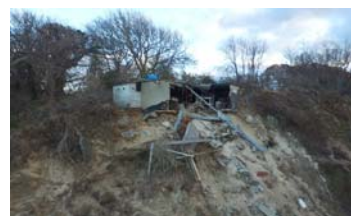
A bluff erosion site in Suffolk County.