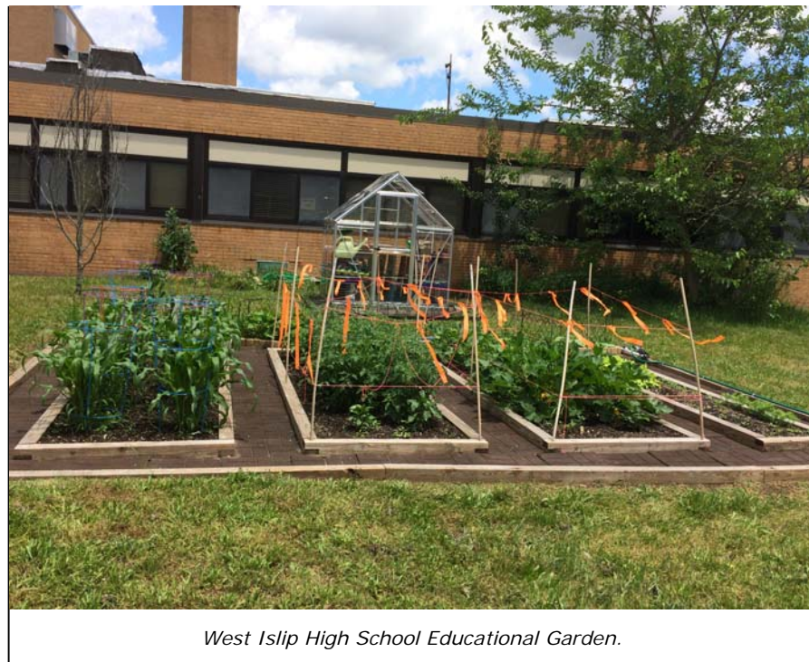
West Islip High School Educational Garden.