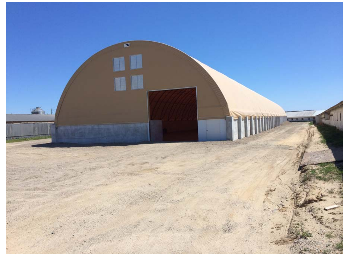
Crescent Duck Farm's Agricultural Waste Storage Facility located in Aquebogue, N.Y.