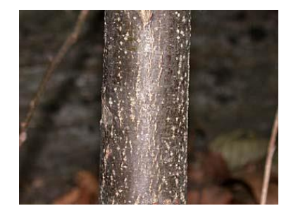
Bark of young sprout

Your mission if you chose to accept it, is to find Blydenburgh's Chestnut trees or look for Chestnut Trees in other Parks and send us and the American Chestnut Foundation the <u>Tree Locator Form</u> when you locate a tree.