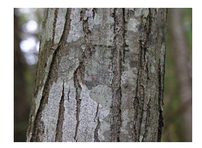
Bark of a healthy tree (very rare)