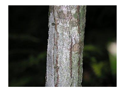
Bark of an older stump sprout (rare)