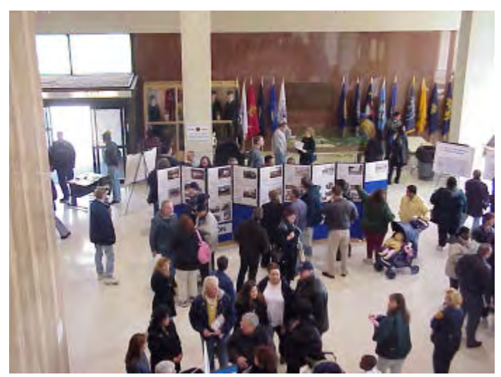
Figure 2 - Suffolk Home Ownership Opportunity Program Housing Fair in the lobby of the H. Lee Dennison Building, Hauppauge, NY on March 23, 2002.