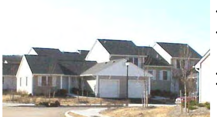
Millennium Hills is a 44 unit affordable housing development in Melville, under construction in 2003.

The County transferred 51 properties to towns and villages in 2003 for affordable housing purposes. Notably, the Village of Patchogue moved quickly to renovate and sell its property located on South Ocean Avenue. The home was sold through lottery to a family of three earning below 80% of median income. This program has proven to be a successful tool for revitalizing many