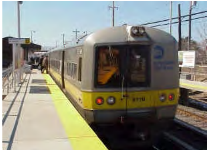
economy of December 2000. The Long Island Railroad employs more than 6,000

Suffolk County continues to experience low unemployment. The unemployment rate in Suffolk County has been consistently lower than the national rate and remains relatively low. In December of 2003 there were 33.900 unemployed Suffolk residents, roughly the same as the number unemployed in December 2002 but 72% more than in the strong Suffolk's 4.4% unemployment Long Islanders. rate is the same as it was a year