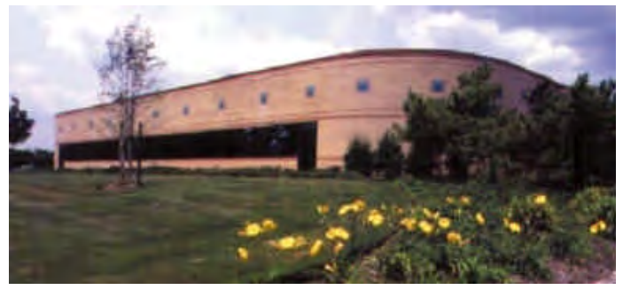
The industrial area in Hauppauge, which along with Melville and Farmingdale, is an employment center with more than 30,000 jobs.

Suffolk County now contains more than 22 million square feet of private office buildings. The eight million square feet of office space built during the 1980s was eventually absorbed as there was not much new office building construction in Suffolk in the early 1990s. But since 1998, more than 4 million square feet of new office space has come on the market. Some of this space has been created by the conversion of industrial buildings to higher