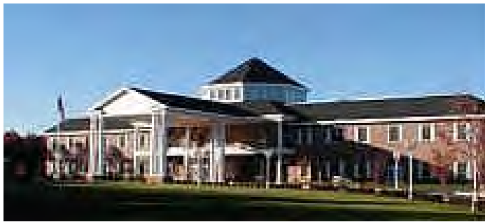
The Inn at East Wind opened in 2003 in Wading River.

After tremendous hotel construction in Suffolk County in the 1980s, several local hotels went into bankruptcy and some closed permanently. No major new hotels opened in Suffolk between 1991 and 1998. But as a result of higher occupancy and room rates in the late 1990s, several large new hotels began to open in Suffolk County starting in 2000. An Extended Stay America hotel opened in 2000 in Melville and a Holiday Inn Express opened in Hauppauge in 2001. In 2002, three major hotels opened in Suffolk: a Hampton Inn in Medford, a Courtyard by Marriott in Lake Ronkonkoma (both near the L. I. E.) and a Marriott Residence Inn in Hauppauge. In 2003 a Hilton Garden Inn opened in Ronkonkoma and the 50 room Inn at East Wind opened in Wading River. A 109 room Wingate Inn in Brentwood and a Marriott Residence Inn in Holtsville are currently under construction. In the past five years, more than 20 new small bed & breakfast inns have opened in eastern Suffolk County. Numerous large new hotels have been proposed to be built in Suffolk County but have not yet started construction. Since 2000, 18 additional new hotels have been proposed for Suffolk County, each with more than 100 rooms and many with suites.