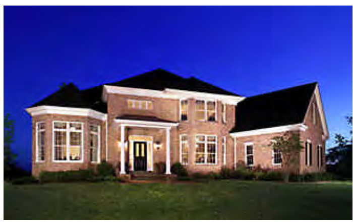
Million dollar homes are part of the redevelopment of the 408 acre Long Island Developmental Center.

In 2002, a surplus 460 acres at the Pilgrim State Psychiatric Center in Brentwood were sold to a developer and a $4 billion mixed-use community has been proposed for the site, containing 1,000,000 square feet of upscale lifestyle retail, 9,000 units of mid-rise rental housing, 3 million square feet of offices, a hotel, a cultural center and the Long Island Aquarium. The development will be built on a pedestrian-friendly grid street system and will contain public and semi-private recreation and open space. The first phase will take five years to complete.