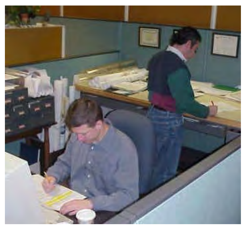
Planning Department Zoning and Subdivision staff at work.

prescribed 20 day Suffolk County Administrative Code notification period, no further action was taken by the Planning Commission. If an objection were to be interposed by a neighboring municipality, a public hearing would have been convened by the Planning Commission. An affirmative vote of ten (10) Commissioners in favor of a resolution of disapproval is required within 45 days for such resolution to be effective.