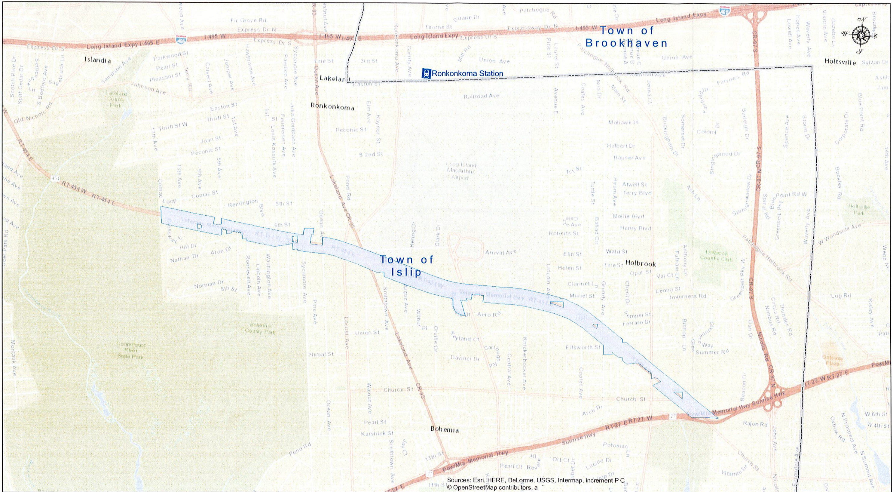
FIGURE 1 STUDY AREA LOCATION MAP Scale: 1 inch = 2,500 feet